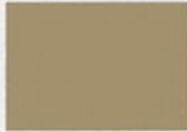
Pecos Beige CC550/3