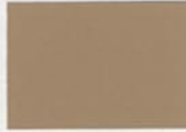
San Jose Buff CC715/1.5